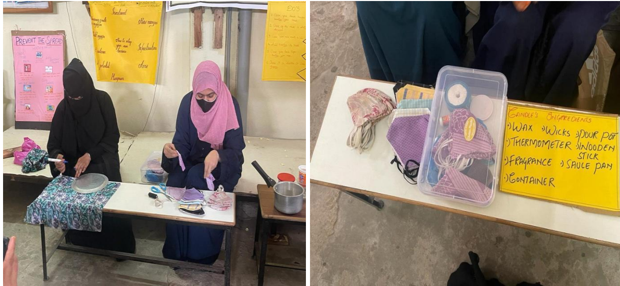
Students demonstrating mask making, stitched masks

Accredited by NAAC; Affiliated to Osmania University