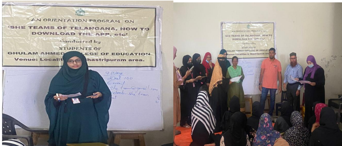
Students explaining how to download the She team app

Accredited by NAAC; Affiliated to Osmania University