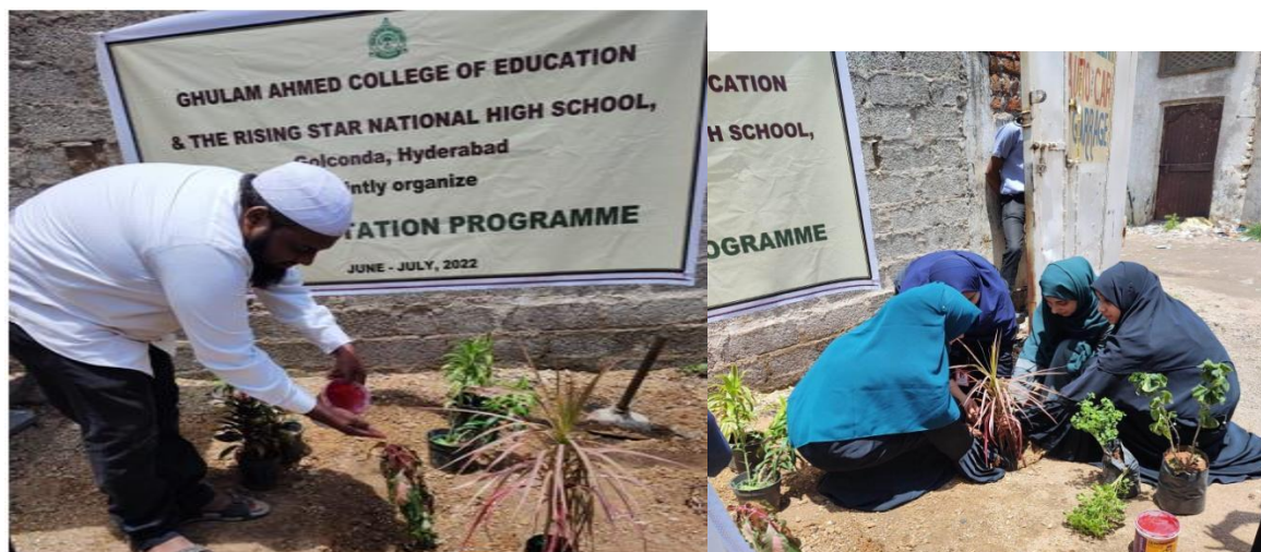
Students planting saplings