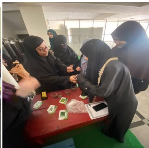
Students demonstrating the making of soap and candles