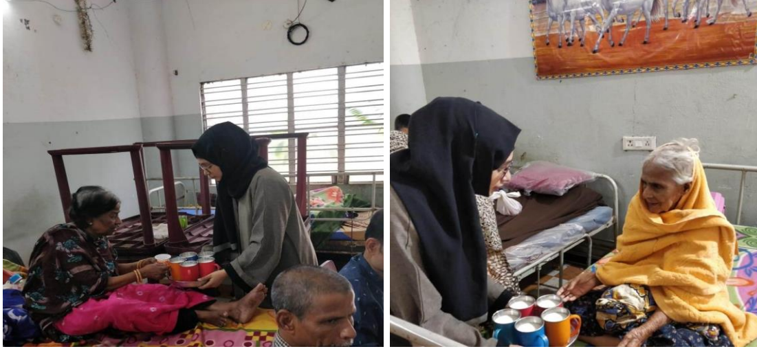
Students distributing food to the needy