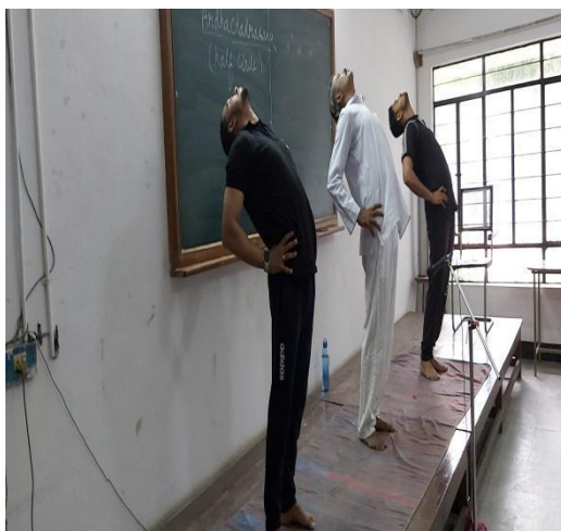
Students practicing Yoga