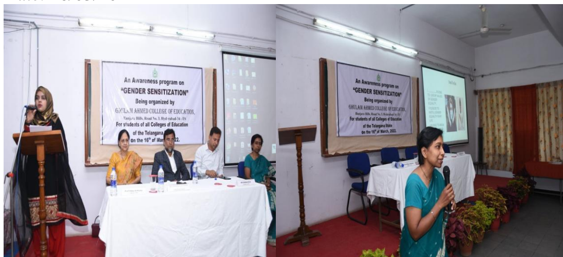
The seminar on Gender sensitivity in progress.