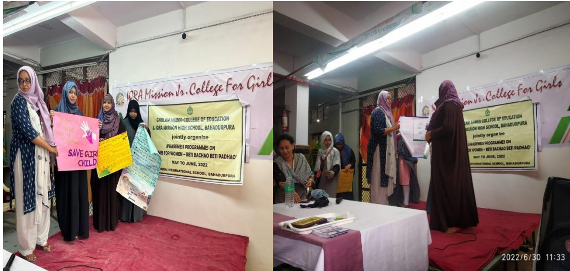
Students conducting awareness program on Beti Bachao, Beti Padhao.

Accredited by NAAC; Affiliated to Osmania University