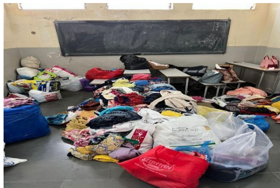
Students sorting the clothes donated for the poor.