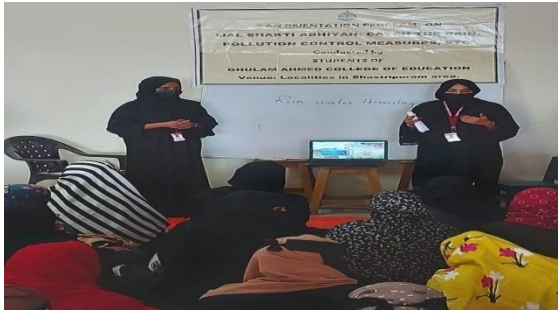
Students conducting an informative session on reducing pollution